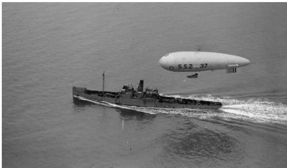
A Submarine Scout Zero class airship on escort duty

At the beginning of March 1918, two new Submarine Scout Zero class airships (S.S.Z. 50 and 51) were assembled at Kingsnorth in Kent. After acceptance flights they set off on March 9 th , en-route to Anglesey where they would enter service as U-boat spotters and convoy support craft.