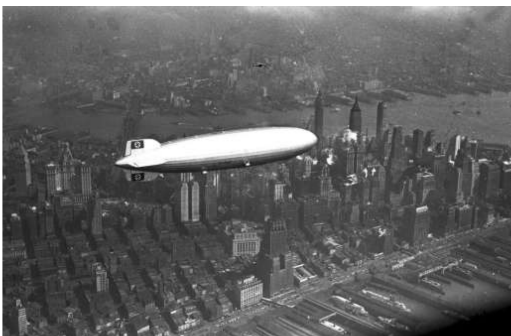
The Hindenburg over New York – note the Nazi insignia

Of course the most famous airship to visit the Aire valley was the ill-fated German craft, the Hindenburg. The Hindenburg was one of the largest airships ever built and between March 1936 and May 1937 it made a number of highly publicised trans-Atlantic passenger flights.