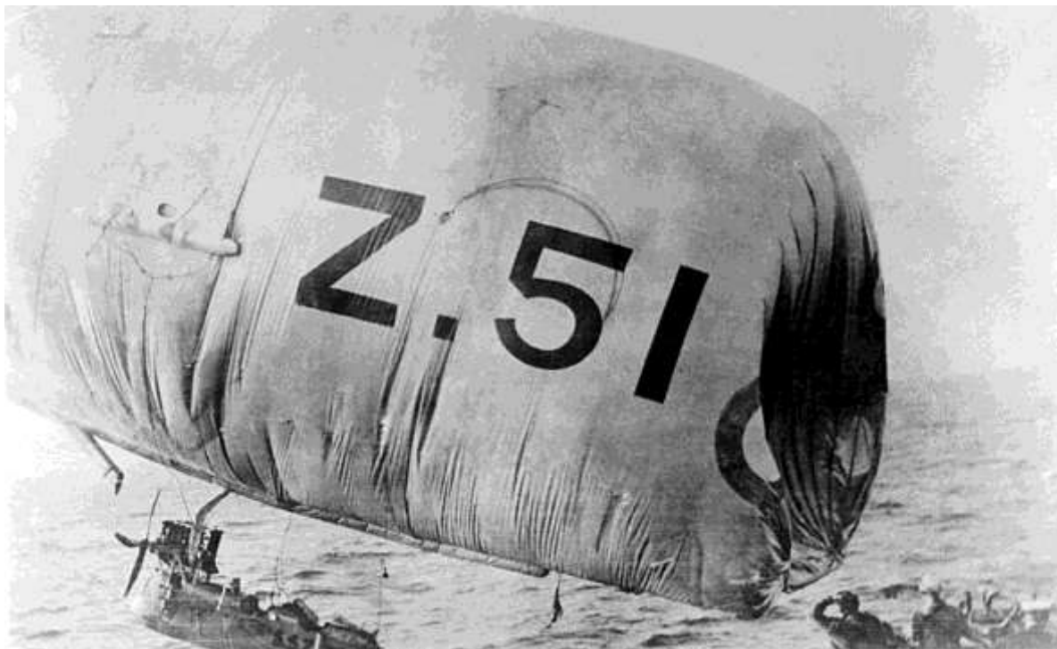
S.S.Z. 51 – about to be lost at sea

She was chased by the USS Downes which eventually caught her and made her fast. As the airship was getting heavy the destroyer lowered a boat and the crew managed to jump into it. The ship was then hauled down onto the deck but the mooring point gave-way, leaving a large hole.